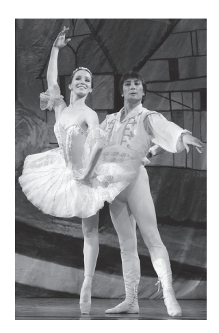
12 Reporting from Scotsman,11 August 200913 Petition signatory 2743

The Swansea based classical dance company Ballet Russe was founded in 1998 by dancers principally from Russia, staying and performing in the UK for 10 months of the year on a salary, until the points-based system forced company members to re-apply under tier 2 (skilled workers with a job offer to fill gaps in the UK labour force) in 2008. Ballet Russe were unable to afford the required fee to become a licensed sponsor, and the dancers, who were all soloists or Principals, were unable to meet the financial or academic requirements to stay in the UK. The issues raised by the Home Office included that the company was not paying the dancers the same going rate as London-based ballet dancers. Ballet Russe tried to reason that Swansea is cheaper to live than London, that the dancers' package included good flats and they worked less than 36 hours per week. The dancers also held degree equivalent qualifications, but these were not recognised. Their rigorous and excellent training in Russia went beyond classical ballet, most of them were accomplished musicians and spoke other European languages, but the bureaucratic rigidity of the points-based system would make no allowances - if they couldn't tick the right boxes, they didn't score the points. The points-